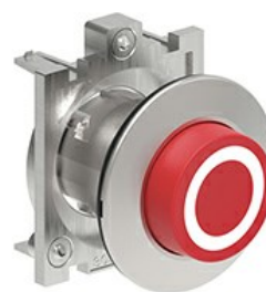
Pushbutton actuators, spring return, with symbol LPFB21