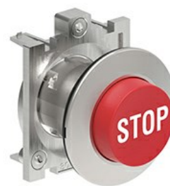
Pushbutton actuators, spring return, with symbol LPFB21