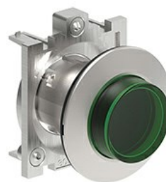
Illuminated button actuators, spring return - Extended LPFBL20