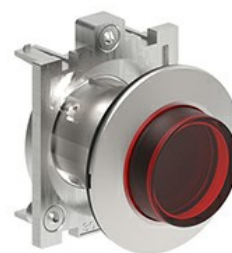
Illuminated button actuators, spring return - Extended LPFBL20