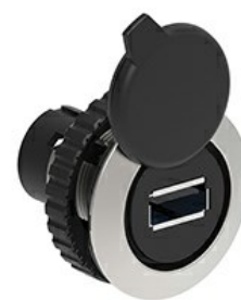
USB interface, A/A female type connection LPFD0