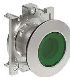
Pilot light head LPFL