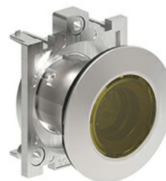
Pilot light head LPFL