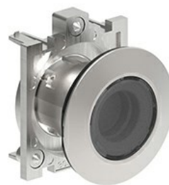
Pilot light head LPFL