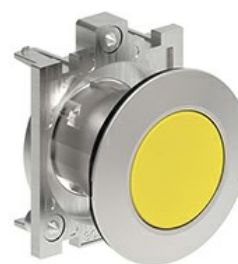
Push-push button actuators LPFQ10