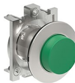
Push-push button actuators LPFQ20