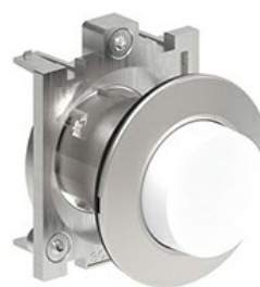
Push-push button actuators LPFQ20