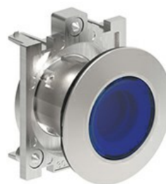
Illuminated push- push button actuators - Flush LPFQL10