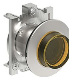
Illuminated push- push button actuators - Extended LPFQL20