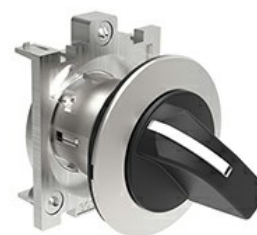
Selector switch actuators lever - 2 position LPFS12