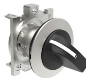
Selector switch actuators lever - 3 position LPFS13