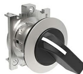
Selector switch actuators long lever - 2 position LPFS22