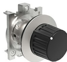
Selector switch actuator knob - 2 position LPFS42