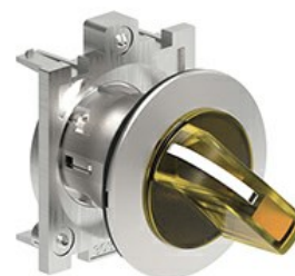
Illuminated selector switch actuator - 3 position LPFSL13