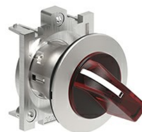
Illuminated selector switch actuator - 3 position LPFSL13