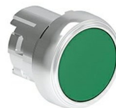
Pushbutton actuator, spring return LPSB10