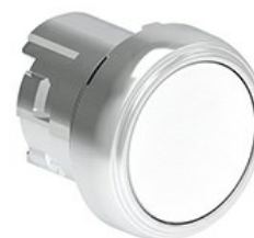
Pushbutton actuator, spring return LPSB10