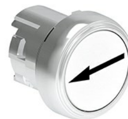
Pushbutton actuators, spring return, with symbol LPSB11