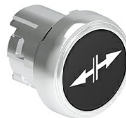
Pushbutton actuators, spring return, with symbol LPSB15