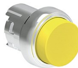
Pushbutton actuator, spring return LPSB20