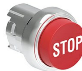
Pushbutton actuators, spring return, with symbol LPSB21