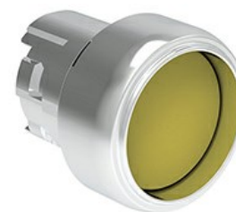
Pushbutton actuator, spring return LPSB30