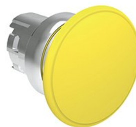
Mushroom head pushbutton, spring return Ø 40mm/1.6" LPSB614