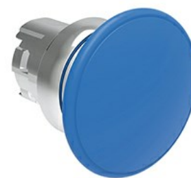
Mushroom head pushbutton, spring return Ø 40mm/1.6" LPSB614