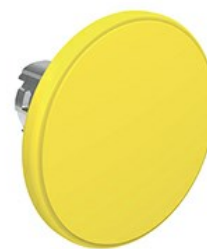
Mushroom head pushbutton, spring return Ø 60mm/2.36" LPSB614