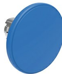
Mushroom head pushbutton, spring return Ø 60mm/2.36" LPSB614