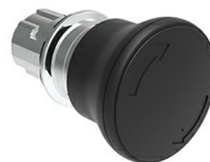
Mushroom head pushbutton, Latch, turn to release Ø 40mm/1.6" LPSB664