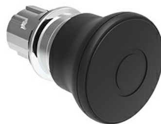
Mushroom head pushbutton, Latch, pull to release Ø 40mm/1.6" LPSB674