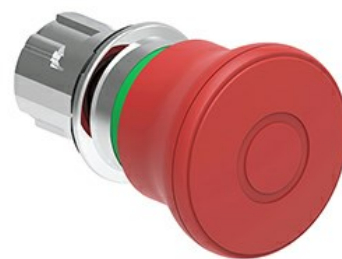
Mushroom head pushbutton, Latch, pull to release Ø 40mm/1.6" LPSB674