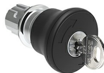
Mushroom head pushbutton, Latch, turn key to release Ø 40mm/1.6" LPSB684