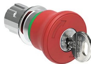
Mushroom head pushbutton, Latch, turn key to release Ø 40mm/1.6" LPSB684