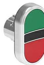
Double-touch actuators, spring return - two flush pushbuttons LPSB71