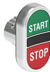
Double-touch actuators, spring return - two flush pushbuttons LPSB71