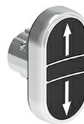
Double-touch actuators, spring return - two flush pushbuttons LPSB71