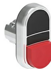
Double-touch actuators, spring return - One extended and one flush pushbuttons LPSB72