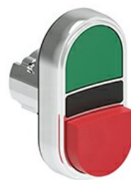
Double-touch actuators, spring return - One extended and one flush pushbuttons LPSB72