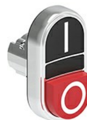
Double-touch actuators, spring return - One extended and one flush pushbuttons LPSB72