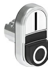
Double-touch actuators, spring return - One extended and one flush pushbuttons LPSB72