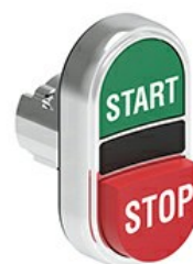
Double-touch actuators, spring return - One extended and one flush pushbuttons LPSB72