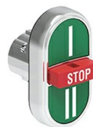
Triple-touch actuators, spring return - One middle extended buttons LPSB73