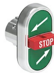
Triple-touch actuators, spring return - One middle extended buttons LPSB73