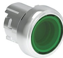
Illuminated button actuators, spring return - Flush LPSBL10