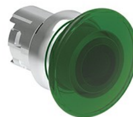
Illuminated mushroom head button actuators - Spring return Ø 40mm/1.6" LPSBL61