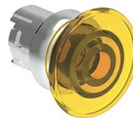
Illuminated mushroom head button actuators - Spring return Ø 40mm/1.6" LPSBL61