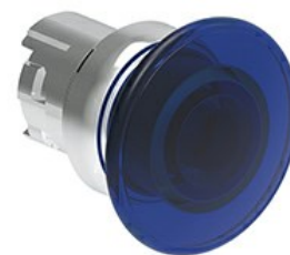
Illuminated mushroom head button actuators - Spring return Ø 40mm/1.6" LPSBL61