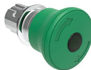
Illuminated mushroom head button actuators - Latch, turn to release Ø 40mm/1.6" LPSBL66